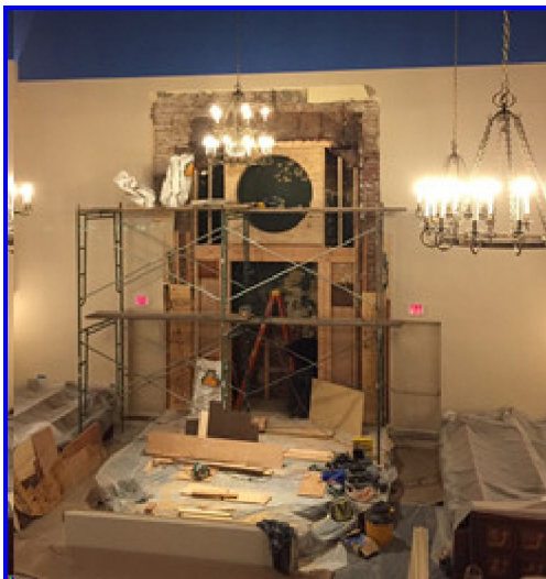
Ark wall under construction